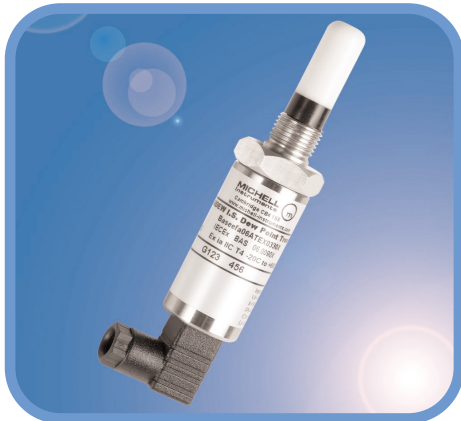
Easidew TX I.S. Transmitter

An ATEX certified, low cost, 2-wire, rugged impedance dew-point transmitter for continuous measurement in hazardous area applications