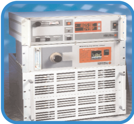
S4000 RS & TRS

A precision, wide range laboratory dew-point hygrometer providing ultimate accuracy, reliability and long-term performance for humidity measurement and calibration